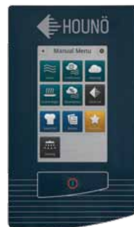
KPE touch model