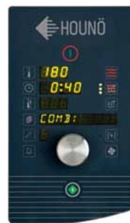
K standard model